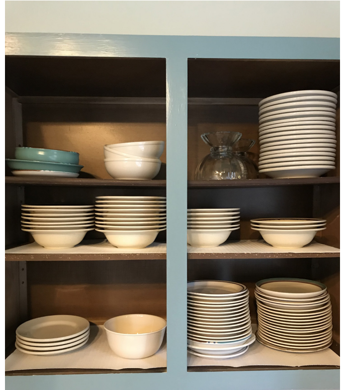
Small Plates - 50; assorted patterns Bowls - 30; assorted patterns