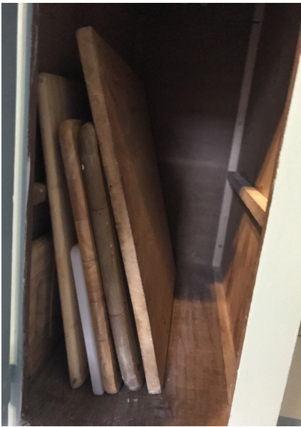
Cutting Boards 6