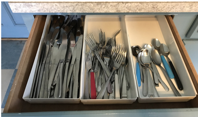
Mismatched Assorted Flatware