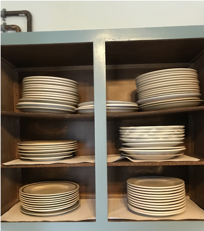
Large Plates - 60; assorted patterns