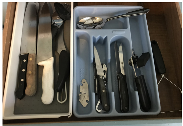
Various Knives (not very sharp) can opener, masher, peeler