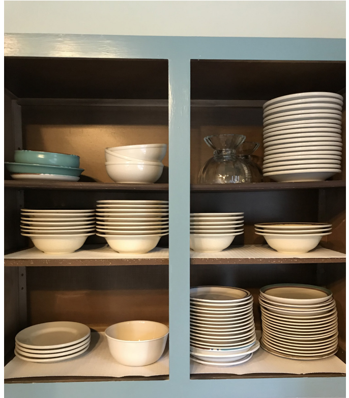
Small Plates - 50; assorted patterns Bowls - 30; assorted patterns